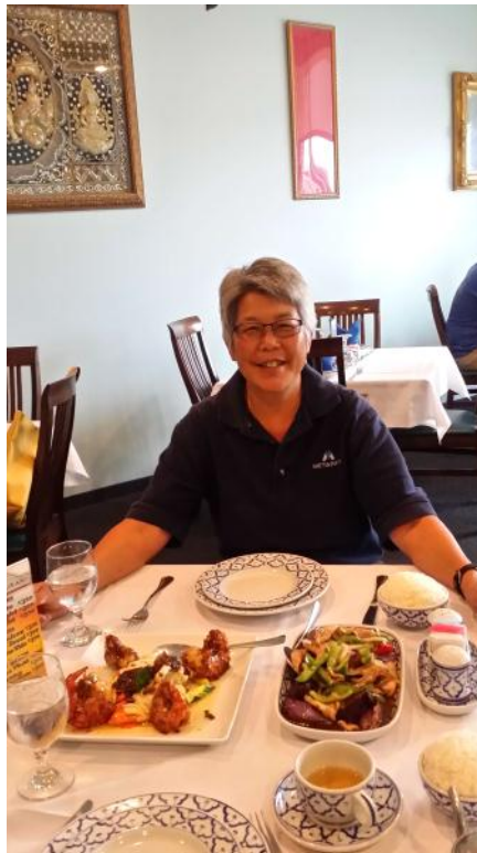
In Billings stayed at Hilltop at Riversage. Ate at Siam Thai.