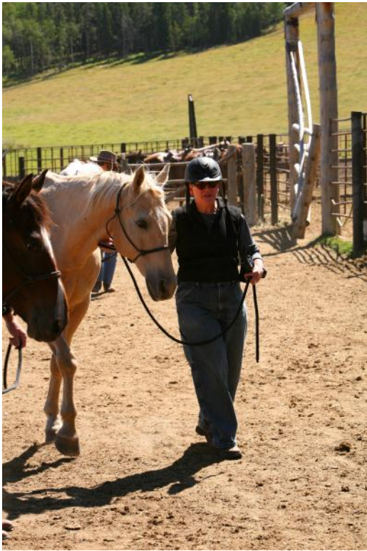
Walk at lunch