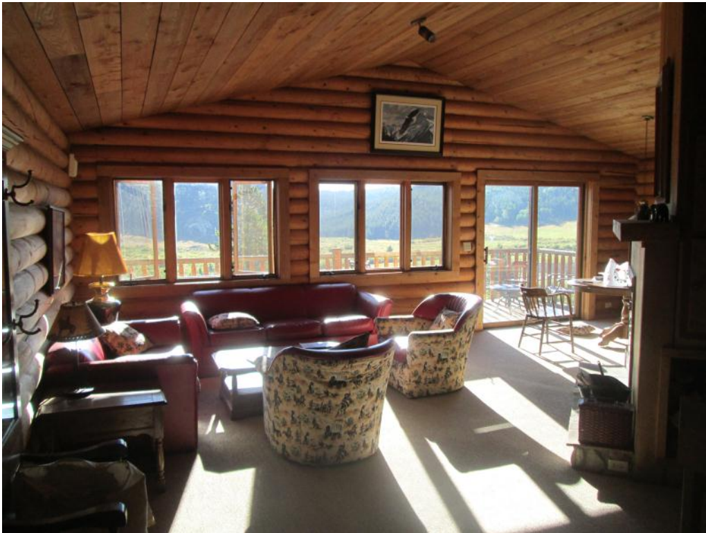
Our Cabin - Eagle's Nest