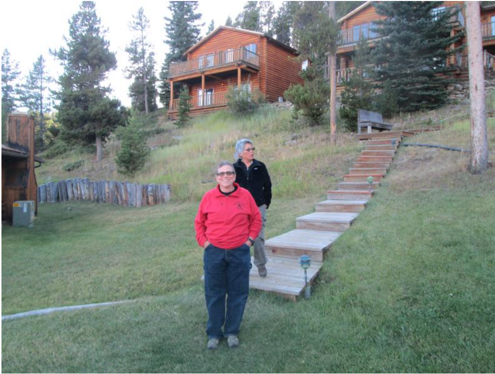
Heading to Breakfast from our Cabin