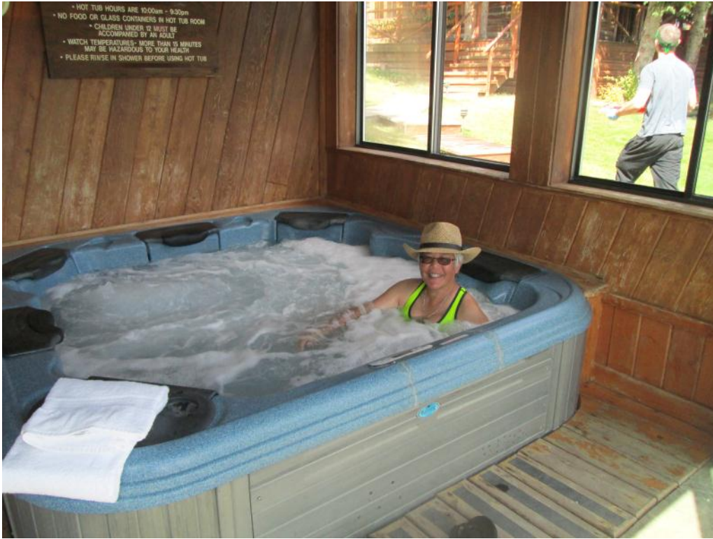
Soothing my muscles in the hot tub