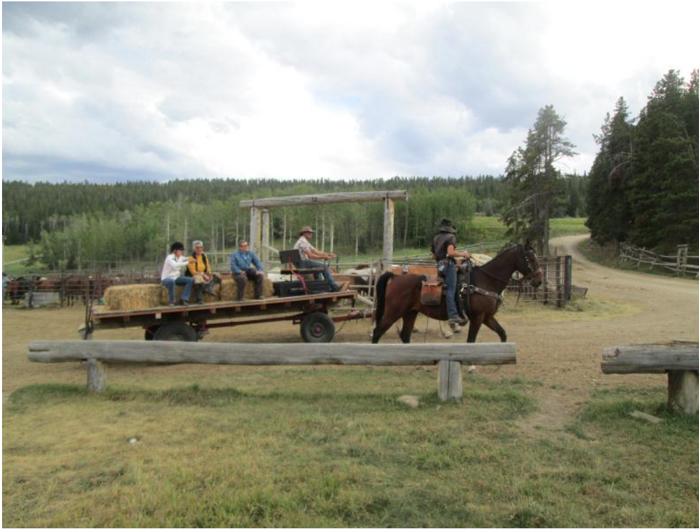
Chuck Wagon Dinner