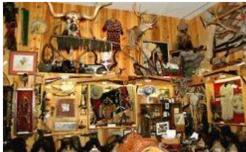
Mint Bar - Most famous bar in Wyoming