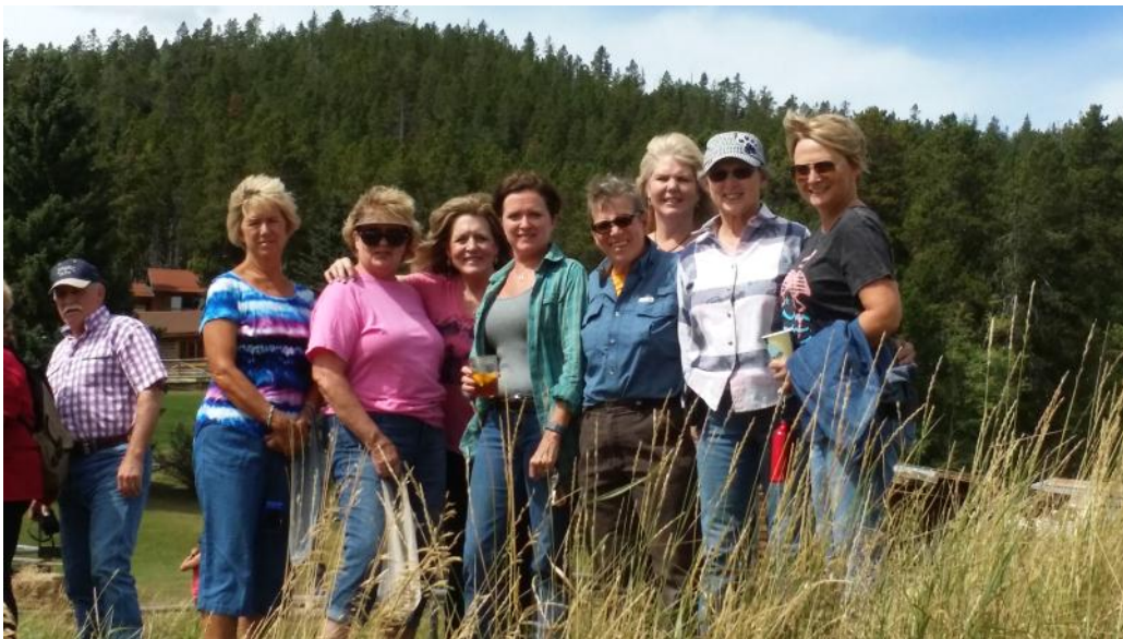
Watching the Horses stampede to their pasture