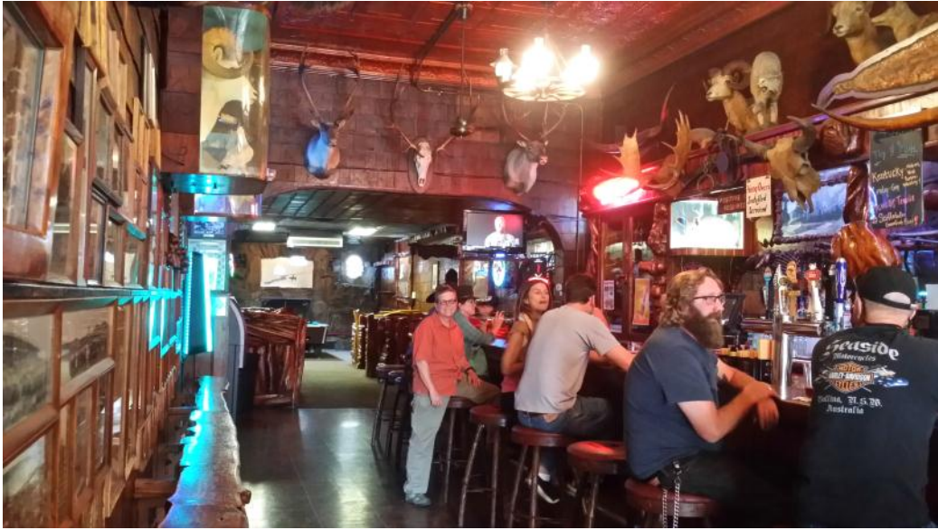
Then Stopped at the Occidental hotel in Buffalo Wyoming.