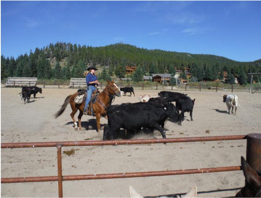
Ivy Givens Setting up the Cows