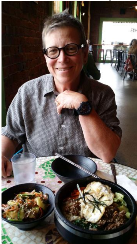
Stopped in Bozeman for lunch at whistling Pig Korean restaurant.