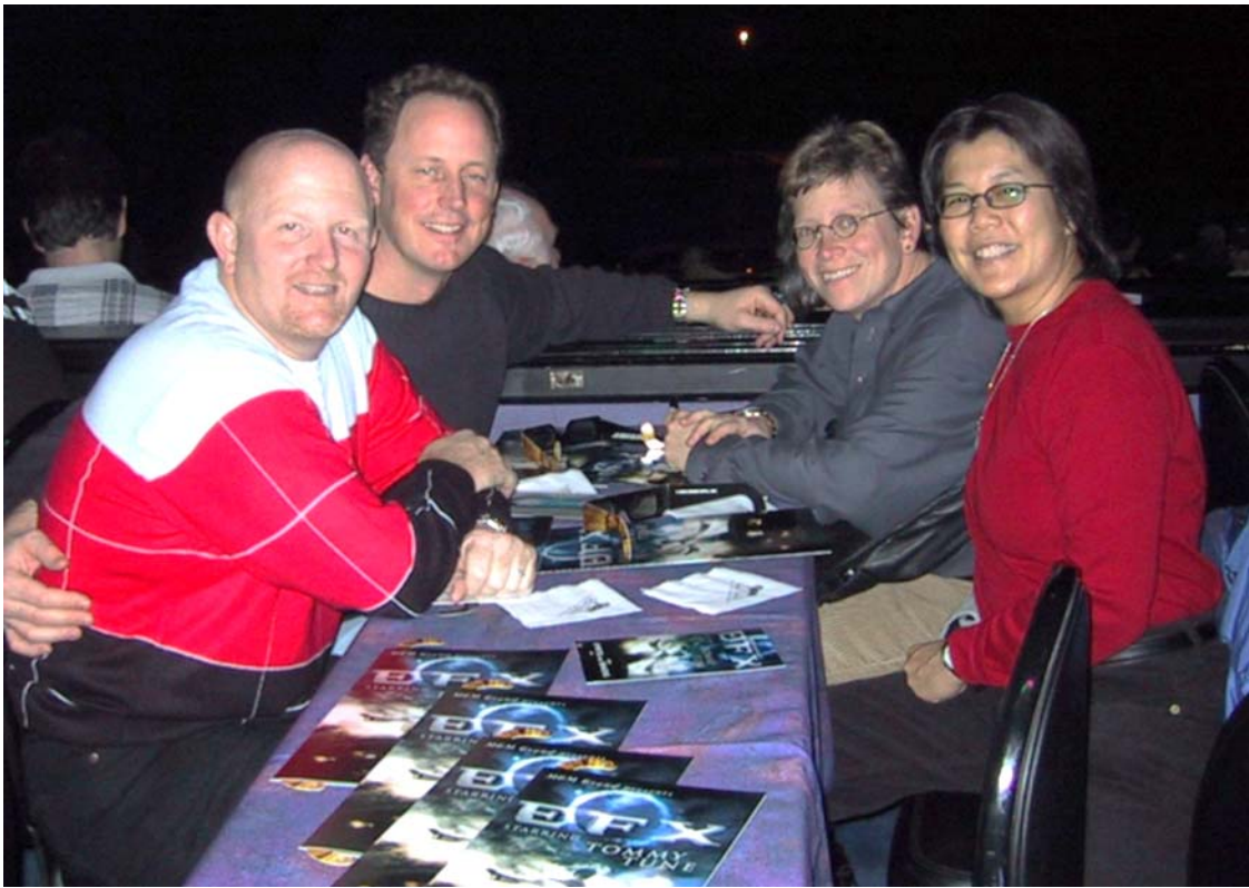
Board Meeting – Las Vegas 12/1/2000