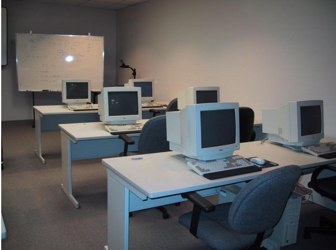
Server Logic Training Room