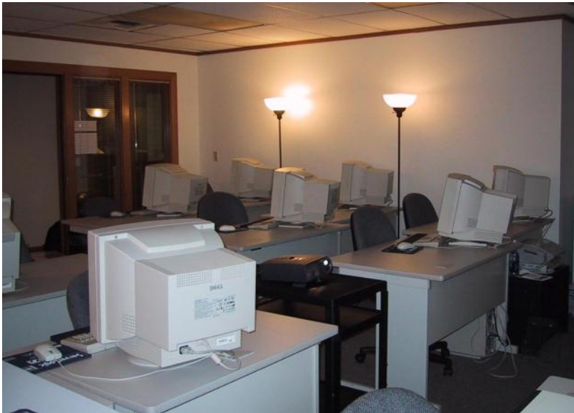
Cabri Training Room 12356 Northup Way Suite 104 Bellevue, WA 98005 (3/7/2002)